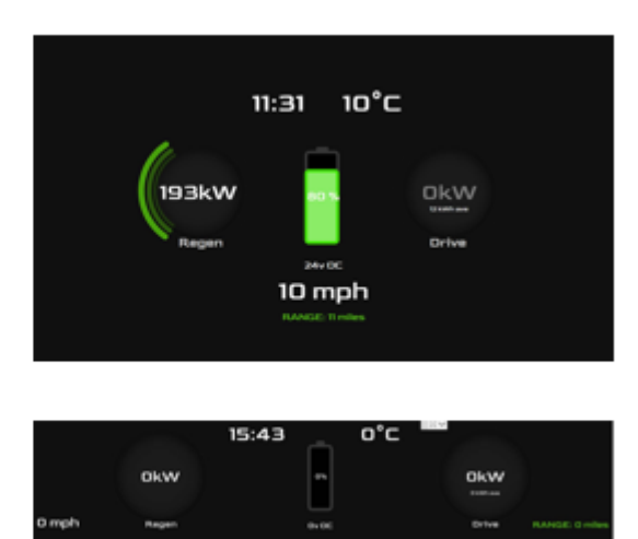
Example dashboard elements for Passenger Displays

Our conversations have led to consideration of re-thinking dashboards to show how installed equipment impacts battery drainage – this will allow for much better analysis and potentially improve the range of vehicles.