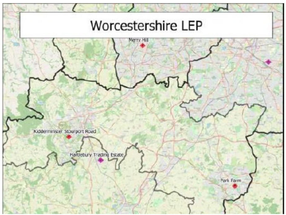
Possible Worcestershire Hydrogen Depot Locations