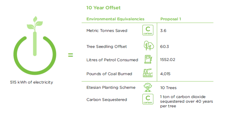
Example of offset data for one shelter.

Annex 3 Figure 1 showcases new Eco shelters that are proposed for Bromsgrove Station installation as well as throughout Bromsgrove initially ( Annex 1 Figure 2 highlights possible locations that are for consideration). These harness power via solar panels and wind turbines to power in-shelter displays, lighting and other sensor technology. Worcestershire was one of the first local authorities to embrace these types of technology in order to increase the level of information provided to passengers whilst reducing energy consumption.