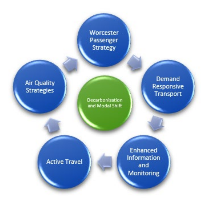
Decarbonisation and Modal Shift Strategies and Initiatives

Worcestershire County Council is highly ambitious in its views and has a number of complementary strategies and initiatives that will be complemented by the introduction of ZEBs.