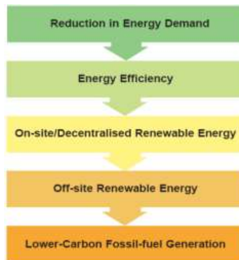
Figure 1: The energy hierarchy