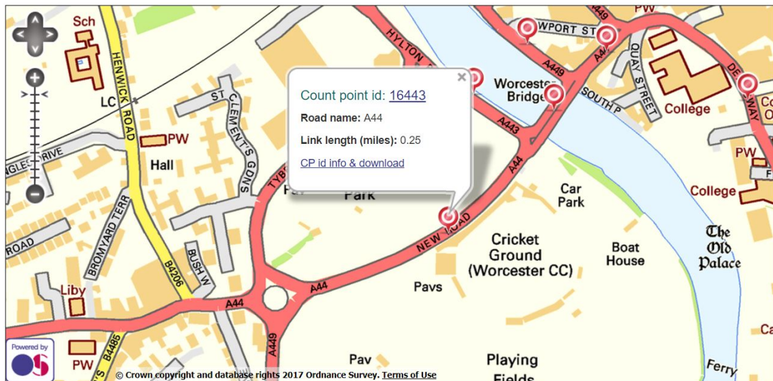
Figure 2: CP 16443 Traffic Count location.

In addition, it was assumed that the journey purpose of car users is following the national trend based on Table NTS0409 of National Travel Survey (2015) and the journey purpose of heavy vehicle users in only work.